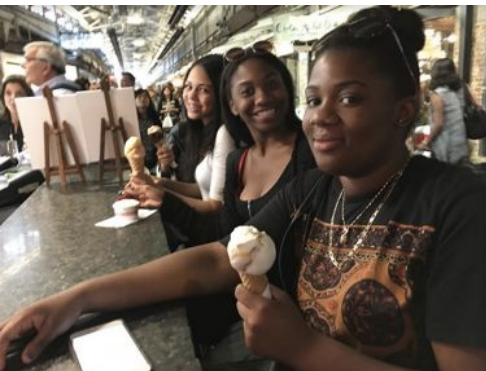
Chelsea Market is a product of the gentrification in the last decade in Manhattan. Chelsea Market has become a destination for locals and tourists alike. Students from Landmark enjoy Artisanal Gelato on a recent newsletter field trip.

The neighborhood of Chelsea in New York City is very big and expensive. One of the best school in Chelsea is the Avenues School - it's a very expensive school and hard to get into. The school is right across from the housing projects in Chelsea, and the kids who live in the projects wish to go to a school like this but unfortunately their parents can't afford it. One thing they talk about in the film is "Class divide". The students in Avenues believe Chelsea is split up between the rich and the poor but the kids who live in the projects believe it is also about race. I don't think there's anything to do but every kid deserves to have an education.